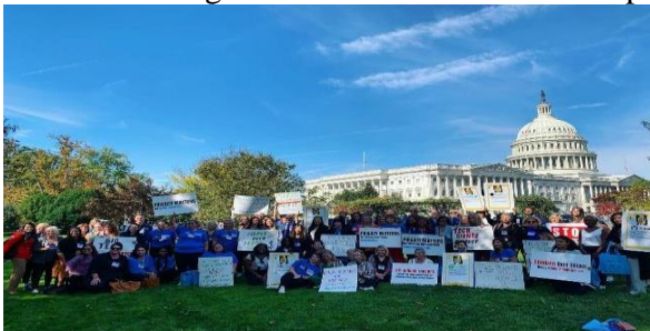
The Advocates Assembled