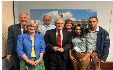
Team 18 meeting with Idaho Senator Risch

The good news is that the following bipartisan bills have been passed out of the Senate Judiciary Committee few months ago, a major hurdle! See below for information and links to some of the actions being taken in Congress: